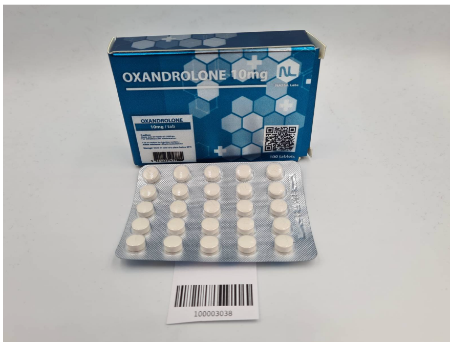
Photo of the test sample

The test sample was applied in the amount of 6µl to the BioBasic 8 Thermo Scientific column. Weight of the whole pill is 204,39mg and weighted portion is 173,87mg. During the course of the analysis with the method a linear gradient in the solutions of H2O and Acetonitrile with the addition of 0.1% trifluoroacetic acid, a peak of the sought substance appeared. Its content, when compared to the reference chromatogram, is 9,86mg/tab. Height the measurement error is + - 0,05mg. The actual state of the sample sent before the test is presented on the photo below