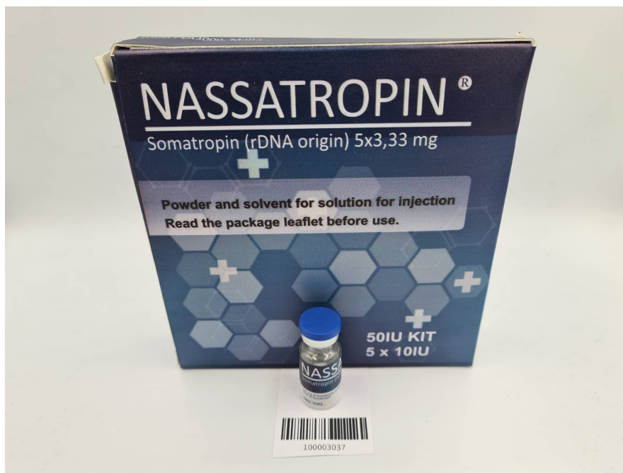
Photo of the test sample

The test sample was applied in the amount of 3 \mu l to the BioBasic 8 Thermo Scientific column. During the course of the analysis with the method a linear gradient in the solutions of H 2 O and Acetonitrile with the addition of 0.1% trifluoroacetic acid, a peak of the sought substance appeared. Its concentration, when compared to the reference chromatogram, is 3,17mg. Height the measurement error is + - 0.05 mg. The actual state of the sample sent before the test is presented on the photo below